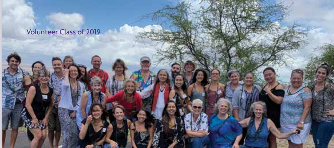
Volunteer Class of 2019