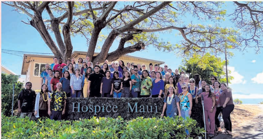
Hospice Maui - All Staff