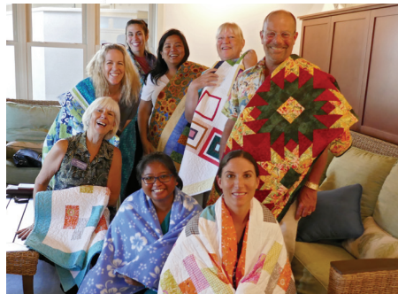
Hospice Maui Hale Quilt ‘Ohana