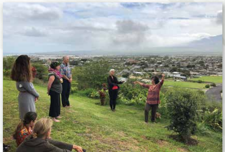
Ōhi'a Lehua tree blessing